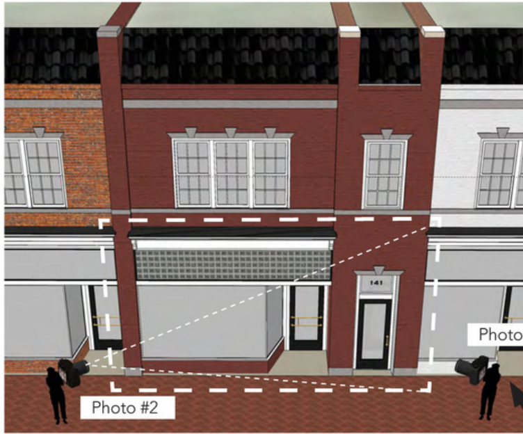
Photo #2: Director standing off to one side and capturing entire lower facade in one photo.